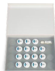
109-0020EU CERABIEN™ MiLai INTERNAL STAIN KIT