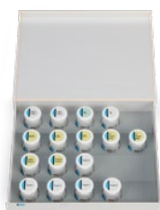
109-0010EU CERABIEN™ MiLai MICRO-LAYERING KIT