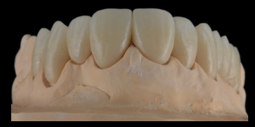
Figure 1: KATANA<sup>™</sup> Zirconia YML 4-unit and 6-unit bridges after milling and sintering. A natural vestibular surface texture plays a decisive role in the creation of aesthetic monolithic restorations.

Usually, the aesthetic potential of a dental ceramic material – specifically its translucency – may be increased only at the expense of a decreased flexural strength. The new KATANA<sup>™</sup> Zirconia YML from Kuraray Noritake Dental Inc. is different. With its high flexural strength of 1,100 MPa in the lower half of the blank and high translucency in the upper body and incisal areas, it has a high aesthetic potential and an unlimited indication range, as shown using the following case example.