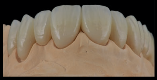
Figure 2: The two bridges on the model after ultra-micro layering with CERABIEN<sup>™</sup> ZR FC Paste Stain (Kuraray Noritake Dental Inc.).