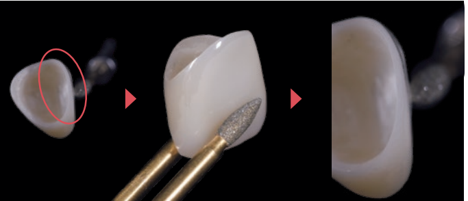
Even if the restoration margins have been milled to a very thin profile, they still show smooth margins without any chipping.