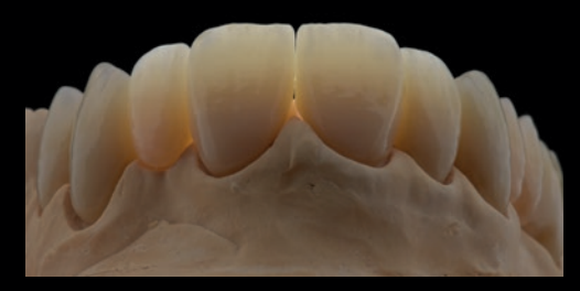
Figure 3: Stained and glazed restorations and their translucency in transmitted light.